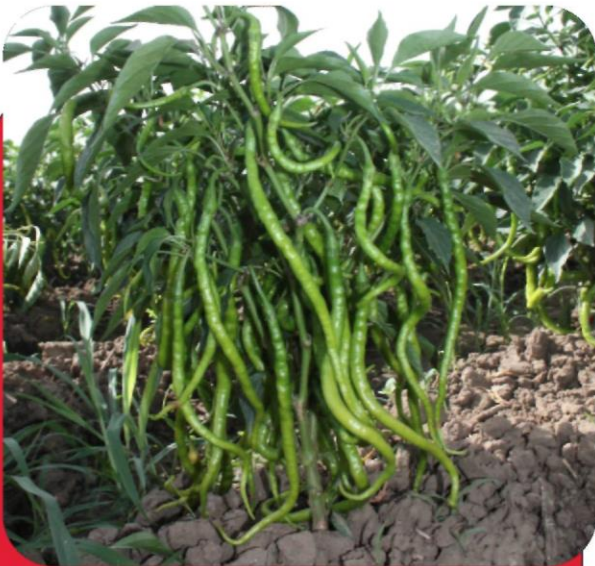
PRODUCT CODE: D22 LONG THIN GREEN PEPPER

TOLERANCE/RESISTANCE: TSWW GROWING AREA, PERIOD: OPEN FIELD PLANT: STABLE PLANT, HIGH YIELD FRUIT: 3-4 LOBED, BRIGHT GREEN SUPERIORITY: THIN SKIN, DOMESTIC MARKET