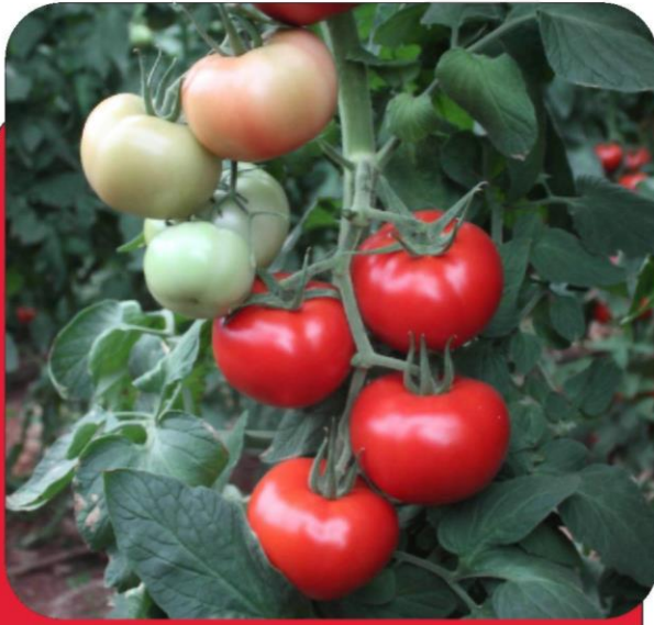
PRODUCT CODE: 1204 INDETERMINATE TOMATO

TOLERANCE/RESISTANCE: TYLCV, FOL, FORL GROWING AREA, PERIOD: SPRING, FALL - GREENHOUSE PLANT: VERY STRONG, LONG-LASTING PLANT FRUIT: HARD, BRIGHT RED, ROUND, HIGH-QUALITY FRUIT, 300 G SUPERIORITY: LARGE FRUIT