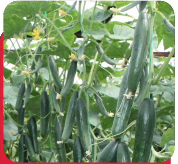
PRODUCT CODE: K2 GREENHOUSE CUCUMBER BEIT ALFA

TOLERANCE/RESISTANCE: GROWING AREA, PERIOD: FALL – SPRING PLANT: STRONG PLANT, WITHOUT SIGHT SHOOTS FRUIT: 17–18 CM, SLITLESS, BRIGHT GREEN SUPERIORITY: HIGH QUALITY, STANDARD FRUIT