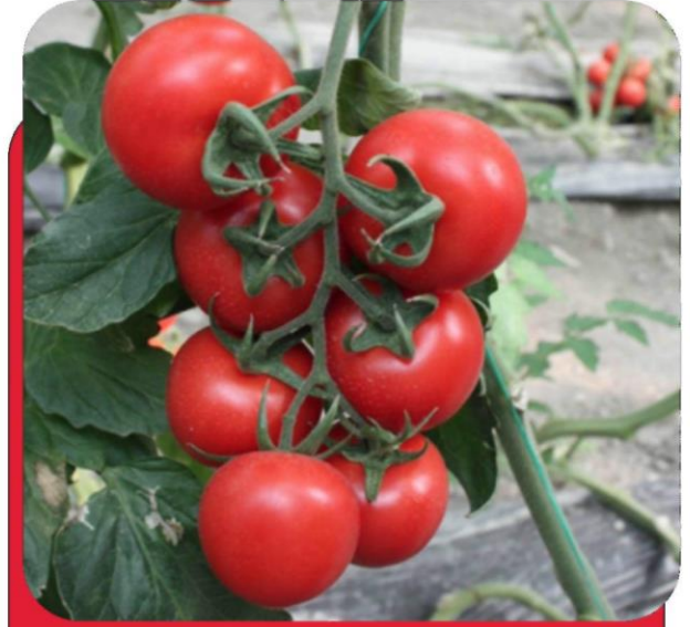
PRODUCT CODE: K38 VINE TOMATO

TOLERANCE/RESISTANCE: TYLCV, FOL, FORL GROWING AREA, PERIOD: WINTER-TYPE GREENHOUSE PLANT: VERY STRONG, LONG-LASTING PLANT FRUIT: HARD, BRIGHT RED, OVAL, HIGH QUALITY FRUIT, 20 G SUPERIORITY: