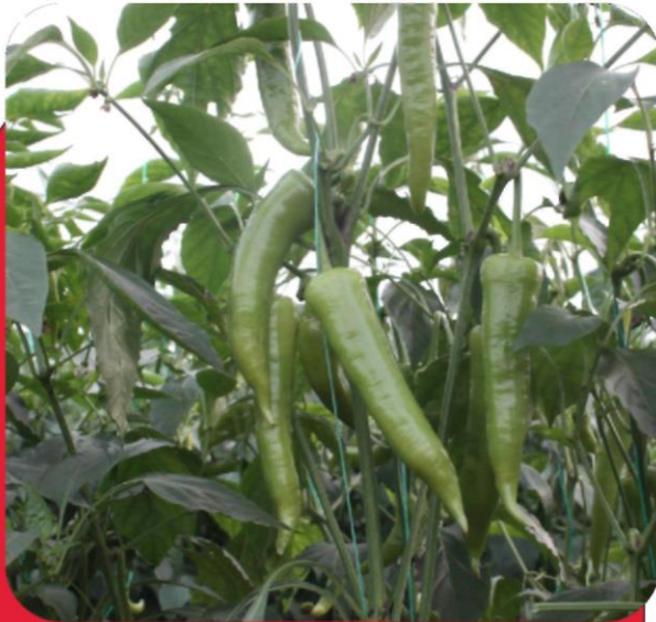
PRODUCT CODE: C19 BANANA PEPPER

TOLERANCE/RESISTANCE: TSWW TOLERANT GROWING AREA, PERIOD: PLANT: STRONG PLANT, HIGH YIELD IN COLD FRUIT: BRIGHT GREEN, LONG, FLESHY, SMOOTH FRUIT SUPERIORITY: