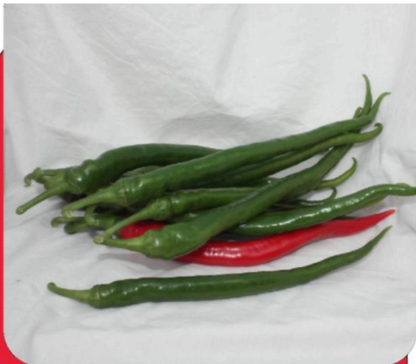
PRODUCT CODE: K41 LONG GREEN PEPPER

TOLERANCE/RESISTANCE: TSWW GROWING AREA, PERIOD: FIELD – TUNNEL PLANT: STRONG PLANT, HIGH YIELD FRUIT: DARK RED, BRIGHT, UNIFORM SHAPE, HIGH QUALITY SUPERIORITY: SUITABLE FOR EXPORT AND MARKET