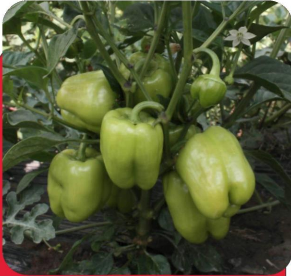
PRODUCT CODE: A41 BELL PEPPER

TOLERANCE/RESISTANCE: TSWW GROWING AREA, PERIOD: FIELD PLANT: STRONG PLANT, HIGH YIELD FRUIT: LIGHT COLOR, BRIGHT, HIGHLY APPEALING SUPERIORITY: