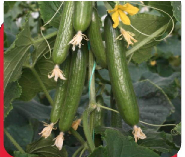
PRODUCT CODE: C44 GREENHOUSE CUCUMBER BEIT ALFA

TOLERANCE/RESISTANCE: MULTI-VIRUS RESISTANCE GROWING AREA, PERIOD: FALL, SPRING - GREENHOUSE PLANT: STRONG PLANT, WITHOUT SIGHT SHOOTS FRUIT: 16–18 CM, SLITLESS, BRIGHT GREEN SUPERIORITY: HIGH YIELD