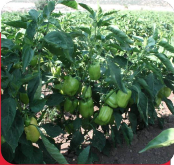
PRODUCT CODE: P18 BELL PEPPER

TOLERANCE/RESISTANCE: TSWW GROWING AREA, PERIOD: OPEN FIELD PLANT: STABLE PLANT, HIGH YIELD FRUIT: 3-4 LOBED, BRIGHT GREEN SUPERIORITY: THIN SKIN, DOMESTIC MARKET