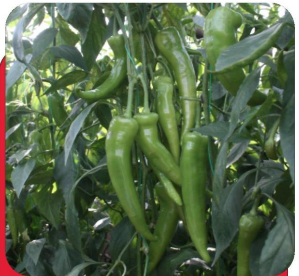
PRODUCT CODE: D10 BANANA PEPPER

TOLERANCE/RESISTANCE: TSWW TOLERANT GROWING AREA, PERIOD: OPEN FIELD PLANT: STABLE PLANT, HIGH YIELD FRUIT: SHORT, CONICAL, LONG SHELF-LIFE SUPERIORITY: SUITABLE FOR EXPORT