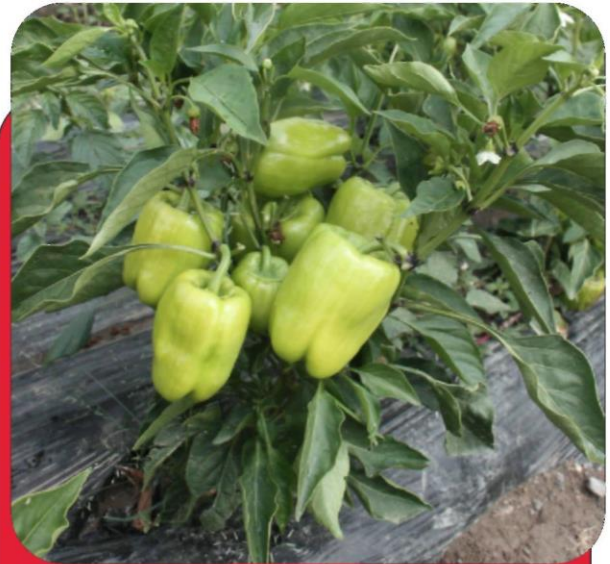
PRODUCT CODE: P15 BELL PEPPER

TOLERANCE/RESISTANCE: TSWW TOLERANT GROWING AREA, PERIOD: PLANT: STRONG PLANT, HIGH YIELD IN COLD FRUIT: BRIGHT GREEN, LONG, FLESHY, SMOOTH FRUIT SUPERIORITY: