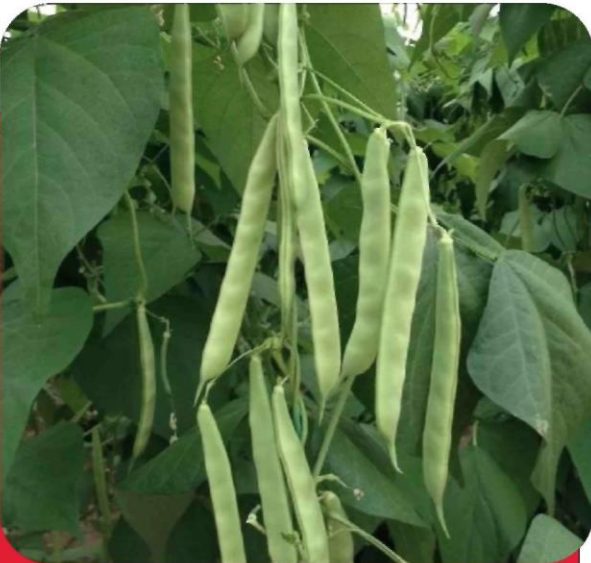
PRODUCT CODE: NADIDE DETERMINATE GREEN BEAN

SUPERIORITY: EARLY, DELICIOUS, HIGHLY APPEALING