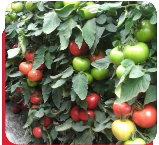
PRODUCT CODE: Z10 INDETERMINATE TOMATO

TOLERANCE/RESISTANCE: GROWING AREA, PERIOD: SPRING, FALL - GREENHOUSE PLANT: STABLE PLANT, HIGH YIELD FRUIT: HARD, OBLATE, HIGH QUALITY FRUIT, 160 G SUPERIORITY: