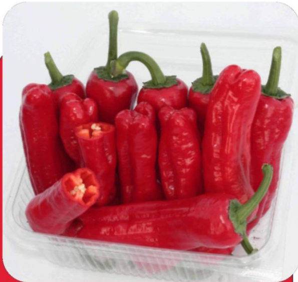
PRODUCT CODE: UB3 HOT URFA PEPPER

TOLERANCE/RESISTANCE: TSWW GROWING AREA, PERIOD: FIELD – TUNNEL PLANT: STRONG PLANT, HIGH YIELD FRUIT: MEDIUM DARK COLOR, BRIGHT SUPERIORITY: