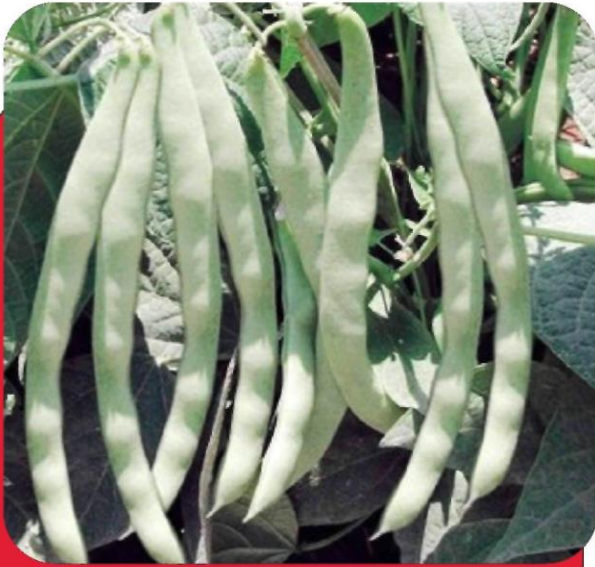
PRODUCT CODE: NADIDE DETERMINATE GREEN BEAN