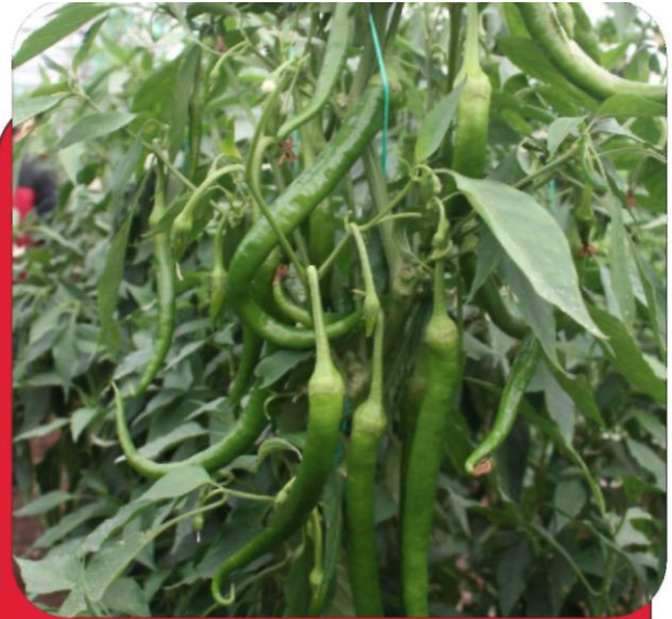
PRODUCT CODE: G14 LONG THIN

TOLERANCE/RESISTANCE: TSWW TOLERANT GROWING AREA, PERIOD: OPEN FIELD – GREENHOUSE PLANT: SUSCEPTIBLE TO POLLINATION, HIGH YIELD FRUIT: THIN, HOODLESS, DARK COLORED SUPERIORITY: 100% SWEET