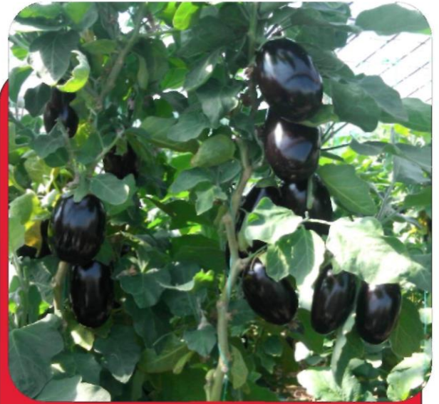
PRODUCT CODE: PASHA ROUND EGGPLANT