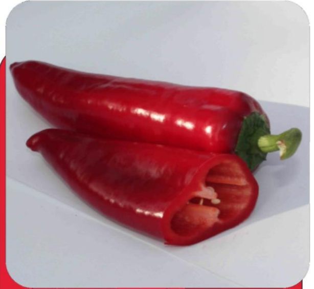
PRODUCT CODE: P27 CAPIA PEPPER

TOLERANCE/RESISTANCE: TSWW HIGH TOLERANCE GROWING AREA, PERIOD: WINTER GREENHOUSE PLANT: STRONG PLANT, YIELD IN COLD FRUIT: EVEN, DARK COLORED SUPERIORITY: 100% SWEET