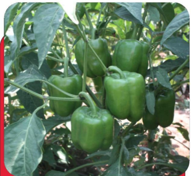
PRODUCT CODE: D2 BELL PEPPER

TOLERANCE/RESISTANCE: GROWING AREA, PERIOD: OPEN FIELD PLANT: STRONG PLANT, HIGH YIELD FRUIT: 4-LOBED, BRIGHT DARK GREEN SUPERIORITY: SUITABLE FOR EXPORT