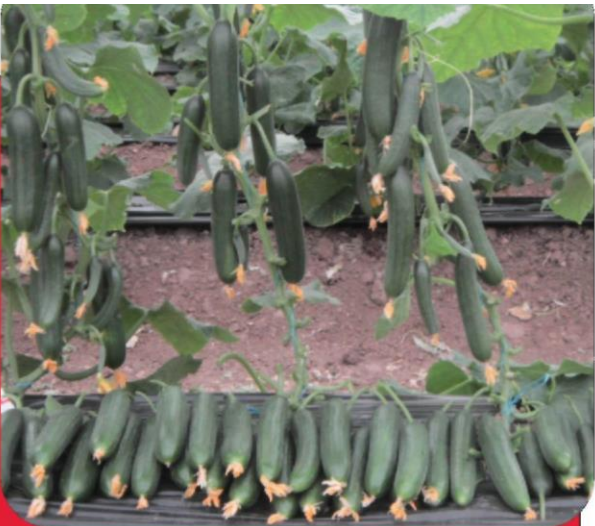
PRODUCT CODE: T1 GREENHOUSE CUCUMBER BEIT ALFA

TOLERANCE/RESISTANCE: TYLCV, FOL, FORL GROWING AREA, PERIOD: SPRING, FALL - GREENHOUSE PLANT: VERY STRONG, LONG-LASTING PLANT FRUIT: HARD, BRIGHT RED, ROUND, HIGH-QUALITY FRUIT, 300 G SUPERIORITY: LARGE FRUIT