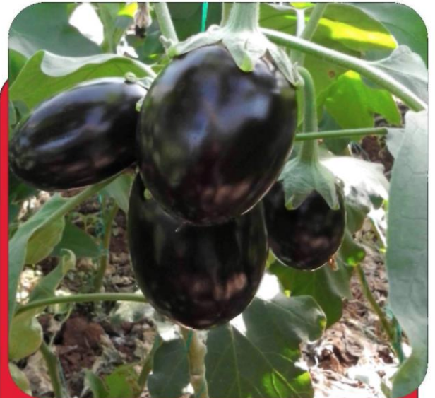
PRODUCT CODE: PASHA ROUND EGGPLANT

SUPERIORITY: FOR ROASTING, QUICK COOKED, DELICIOUS