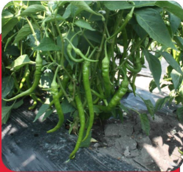
PRODUCT CODE: K42 LONG GREEN PEPPER

TOLERANCE/RESISTANCE: TSWW GROWING AREA, PERIOD: FIELD AND TUNNEL PLANT: STRONG PLANT, HIGH YIELD FRUIT: MEDIUM DARK COLOR, BRIGHT SUPERIORITY: