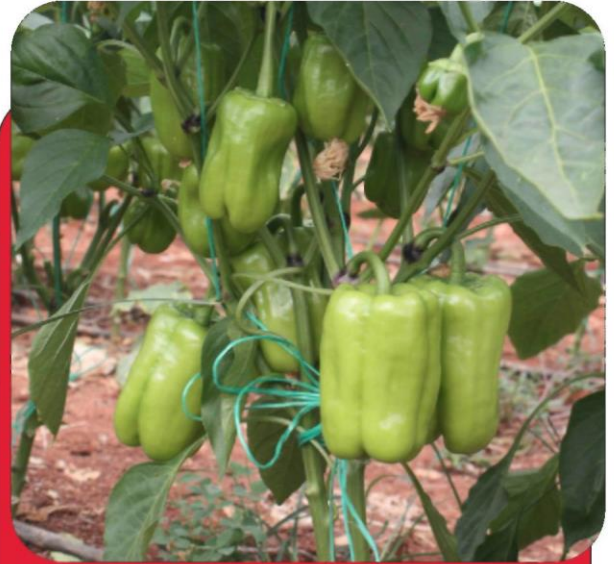
PRODUCT CODE: P17 BELL PEPPER

TOLERANCE/RESISTANCE: TSWW GROWING AREA, PERIOD: FIELD PLANT: STRONG PLANT, HIGH YIELD FRUIT: LIGHT COLOR, BRIGHT, HIGHLY APPEALING SUPERIORITY: