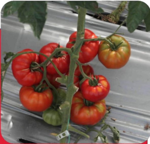
PRODUCT CODE: R40B HEIRLOOM TOMATO

TOLERANCE/RESISTANCE: TYLCV, FOL, FORL GROWING AREA, PERIOD: WINTER-TYPE GREENHOUSE PLANT: VERY STRONG, LONG-LASTING PLANT FRUIT: HARD, BRIGHT RED, ROUND, HIGH-QUALITY FRUIT SUPERIORITY: