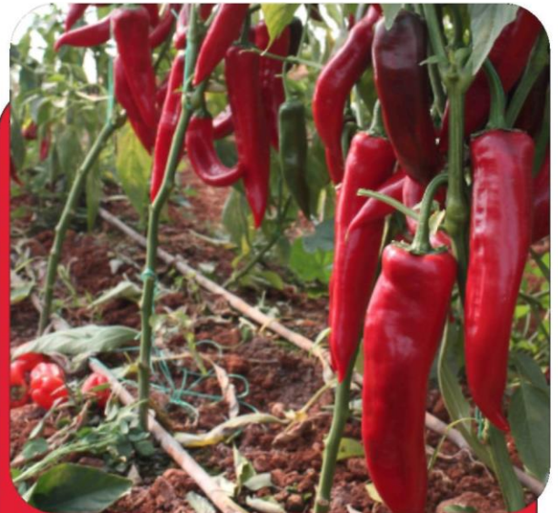
PRODUCT CODE: K2 CAPIA PEPPER

TOLERANCE/RESISTANCE: GROWING AREA, PERIOD: FIELD – TUNNEL PLANT: STRONG PLANT, HIGH YIELD FRUIT: MEDIUM THIN SKIN, DARK RED SUPERIORITY: VERY HOT