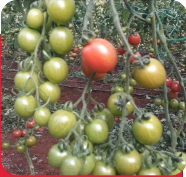
PRODUCT CODE: H26 COCKTAIL TOMATO

TOLERANCE/RESISTANCE: TYLCV, FOL, FORL GROWING AREA, PERIOD: WINTER-TYPE GREENHOUSE PLANT: VERY STRONG, LONG-LASTING PLANT FRUIT: HARD, BRIGHT RED, OVAL, HIGH QUALITY FRUIT, 20 G SUPERIORITY: